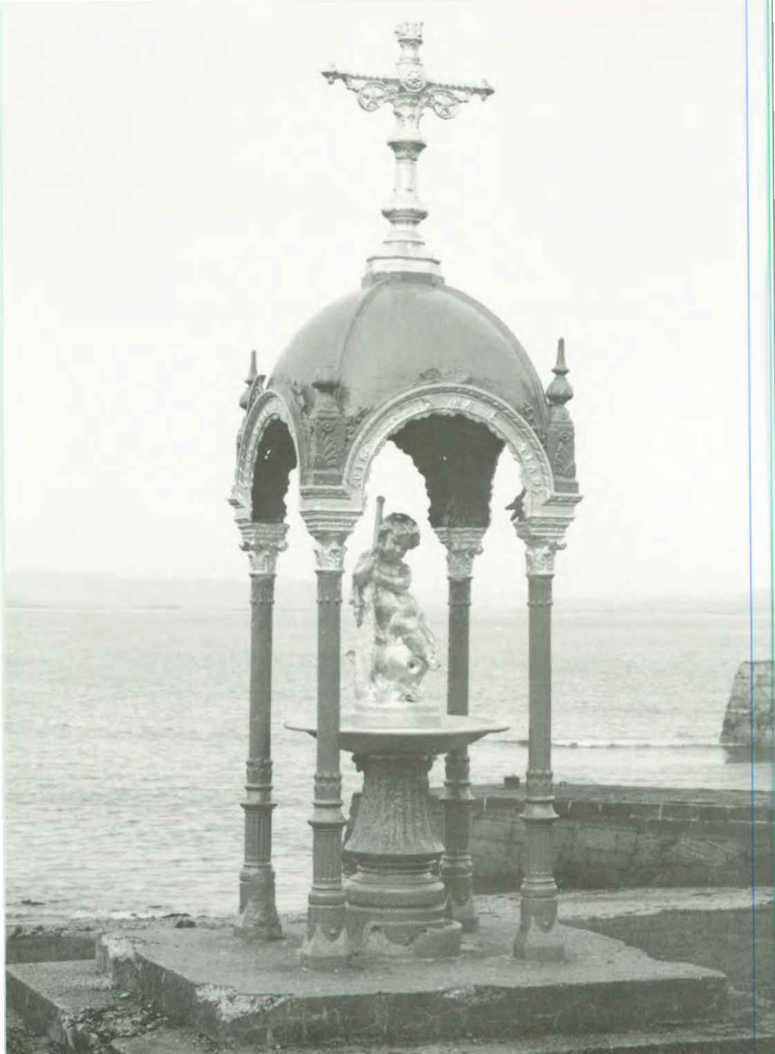
Cast-iron fountain, Portmahomack.