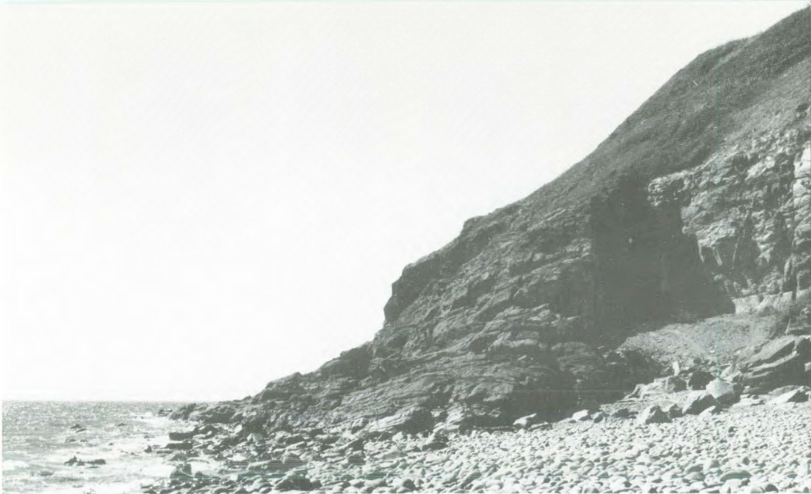
St Ninian's Cave: general view from south.